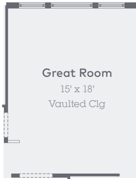
Optional Picture Window in Great Room (In lieu of 3 standard windows)